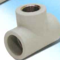
Threaded Female Tee