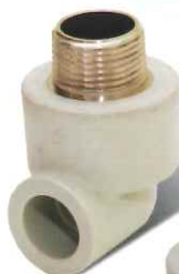
Threaded Male Elbow 90°