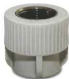
Threaded Female Coupling