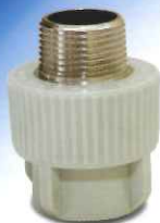
Threaded Male Coupling