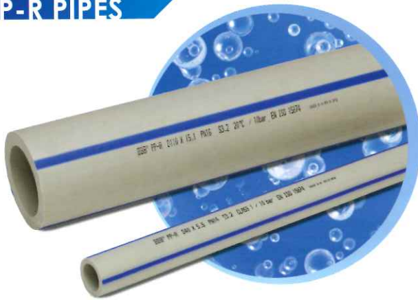
PN10 and PN16 PP-R Pipes