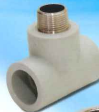
Threaded Male Tee