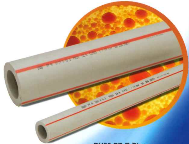
PN20 PP-R Pipes