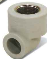
Threaded Female Elbow 90°