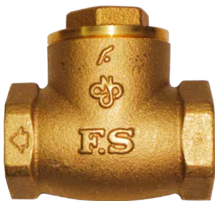
BRASS FIG : F1151S BRONZE FIG : F1251S

Test pressure : Shell 300PSI (20.7bar) Seat 200PSI (13.8bar)