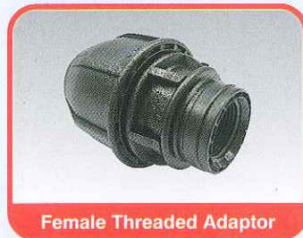
Female Threaded Adaptor