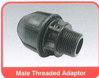
Male Threaded Adaptor