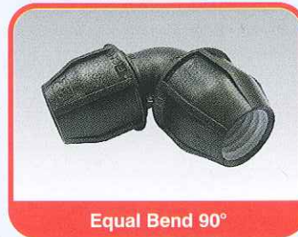
Equal Bend 90°