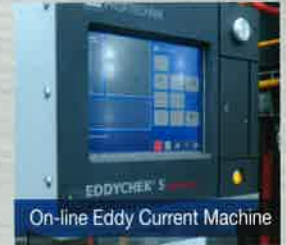
On-line Eddy Current Machine