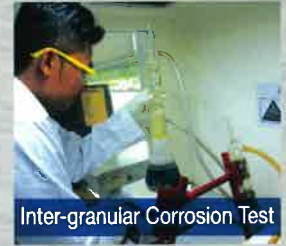
Inter-granular Corrosion Test

From slitting, forming, solution annealing, sizing, straightening, pickling are under consistent rigid manufacturing procedure. Hydrostatic Test, Inter-granular Corrosion Test, Eddy Current Test & Mechanical Test are to assure quality in accordance with ASTM, ASME or other applicable standards. Other more comprehensive testing, such as radiographic test and metallurgy microscopic structure testing can be arranged according to client's project demand too.