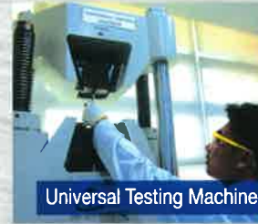
Universal Testing Machine